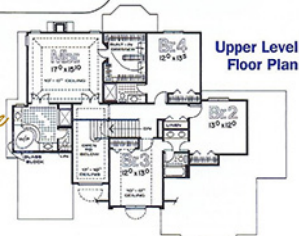
Upper Level Floor Plan